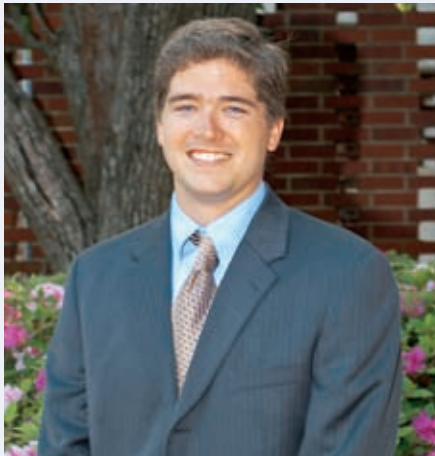
Institute of Management Accountants Outstanding Graduate Student