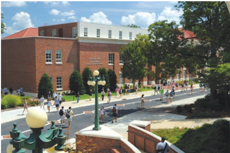
Four accountancy students currently work in the Office of Internal Audit. The experience allows them to positively affect university operations across campus.

Accounting students interested in the internship program can contact Mills at tmills@olemiss.edu or visit www.olemiss.edu/depts/internal_audit . ■