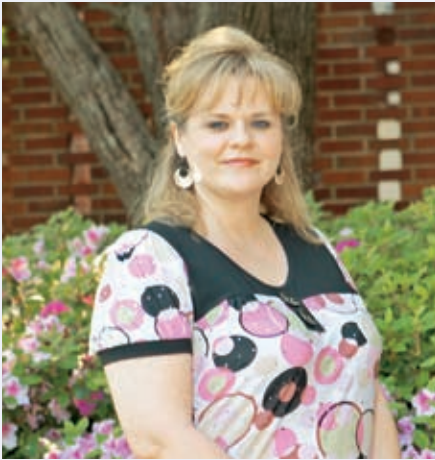
Outstanding Accounting Major—Tupelo Center