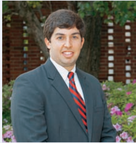
Mississippi Society of CPAs Achievement Award