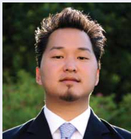
Lefoldt & Co./Waller Fellowship 2011