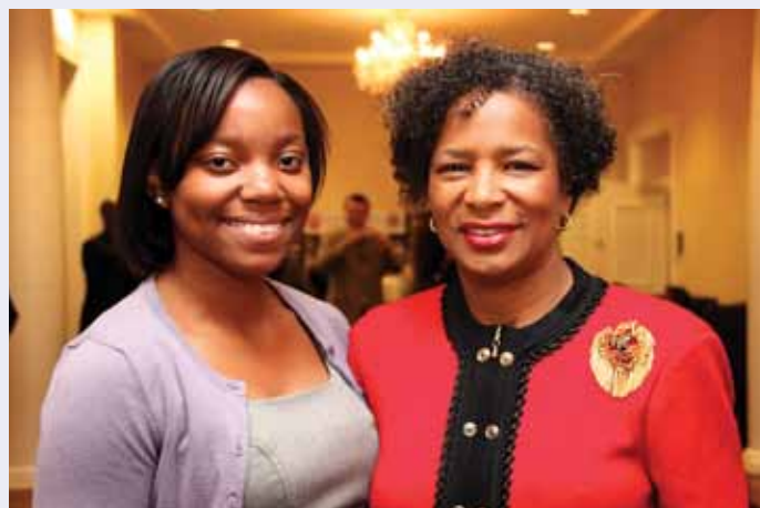
Hickonbottom Women's Council Scholarship