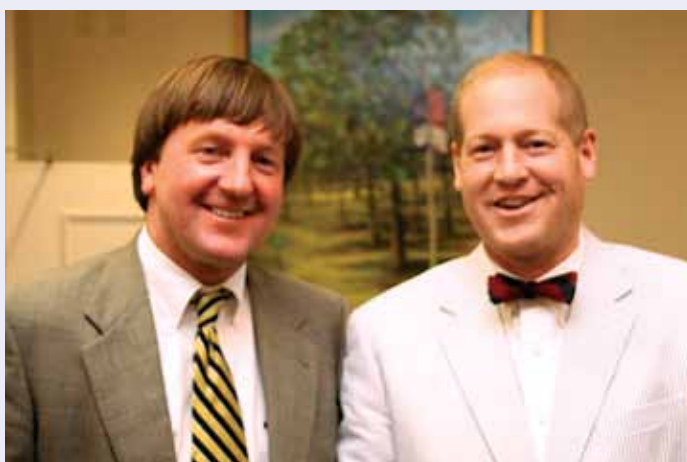
Doctoral Teaching Award 2011