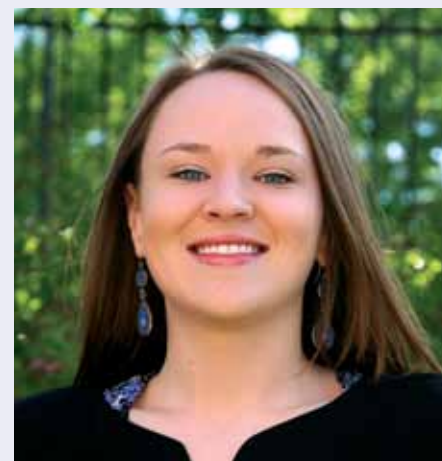
Financial Executives International Scholarship 2010