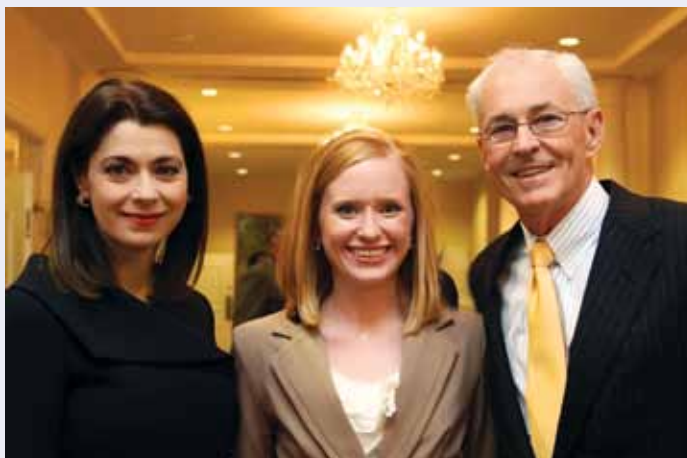
Deloach & Ray Scholarship 2010-11