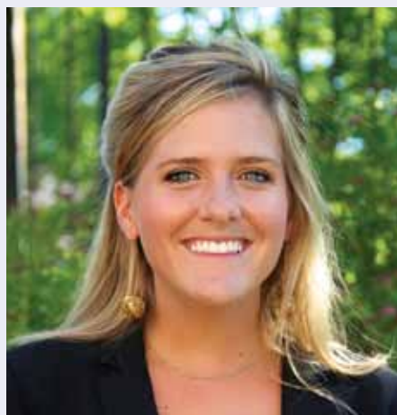
KPMG Peat Marwick Fellowship 2011